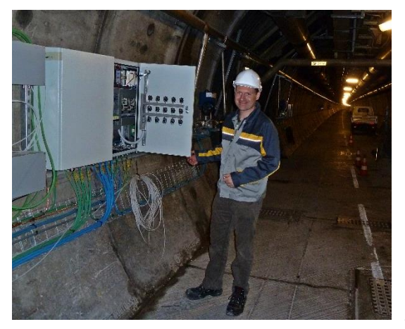
Equipment in SAFE station

Four SAFE stations - around 900 meters long – are equipped with AP Sensing linear heat detection and monitoring systems. Once a train has stopped at a SAFE station, the systems detect the exact location of any fire regardless of high air currents. The specific fire location data is used to trigger the Fogtec high pressure water mist suppression system with pinpoint accuracy. A total of 16 AP Sensing LHD units are installed, monitoring each of the SAFE stations with full redundancy.