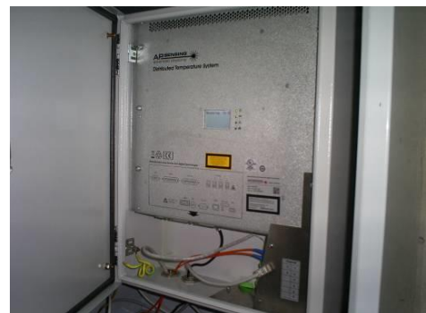
Outdoor DTS instrument directly installed in utility tunnel