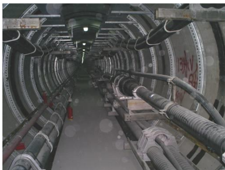
500 kV high voltage power cable utility tunnel in Shanghai

Two AP Sensing “Linear Power Series” DTS instruments are installed in the middle of a cable tunnel. Each DTS unit has two channels. The temperature data is transmitted to the management PC via a LAN interface.