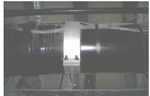
500kV joint with sensing fiber