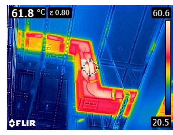
Above: Thermal image of cable installed along bus duct Below: Sensor cable fitted on bus duct

The end client requested a comparison of temperature measurements made with our DTS vs. traditional thermography during stress testing of the bus duct infrastructure. In the end, the client was impressed by the consistency of the DTS temperature measurements and the ease of obtaining the data.