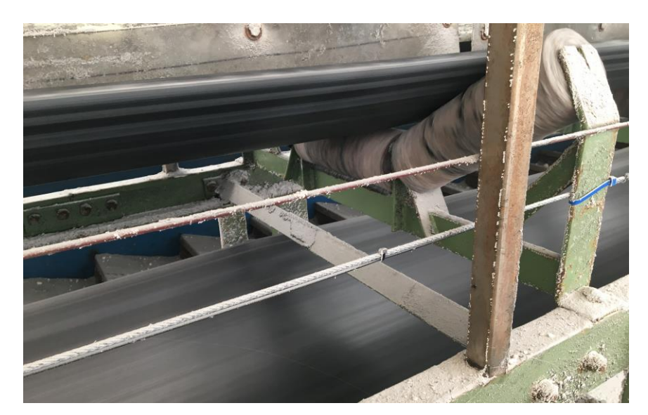
Cable installation (black), attached to the tension wire

Following a successful pilot installation, K+S installed 11 fiber optic LHD units. All units have two channels and work in a fully redundant setup. AP Sensing's Sensor Cable Steel is installed along both sides of each conveyor to achieve maximum coverage and the fastest possible detection. The cable has been fixed with high temperature cable ties along a tension wire.