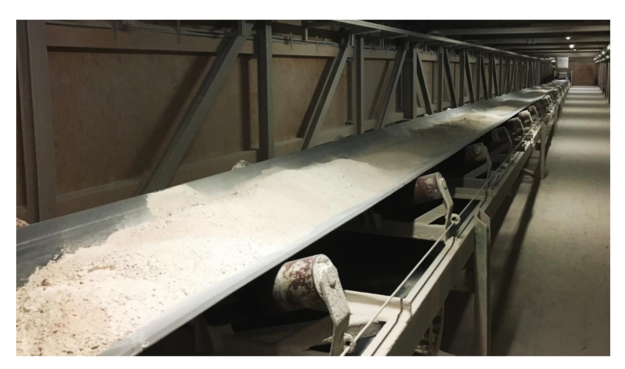
Salt Conveyor Belt at Zielitz Operation

In total, 22 conveyor belts are monitored with 11 LHD devices spread across the entire site. The operator, K+S, conducted trials and a benchmark comparison at the beginning of the project, additionally testing thermo cameras and point sensors. But due to the salty air in the conveyor belt bridges, the other sensor types were unsatisfactory as the corrosion of components is high, visibility low, and the maintenance effort higher.