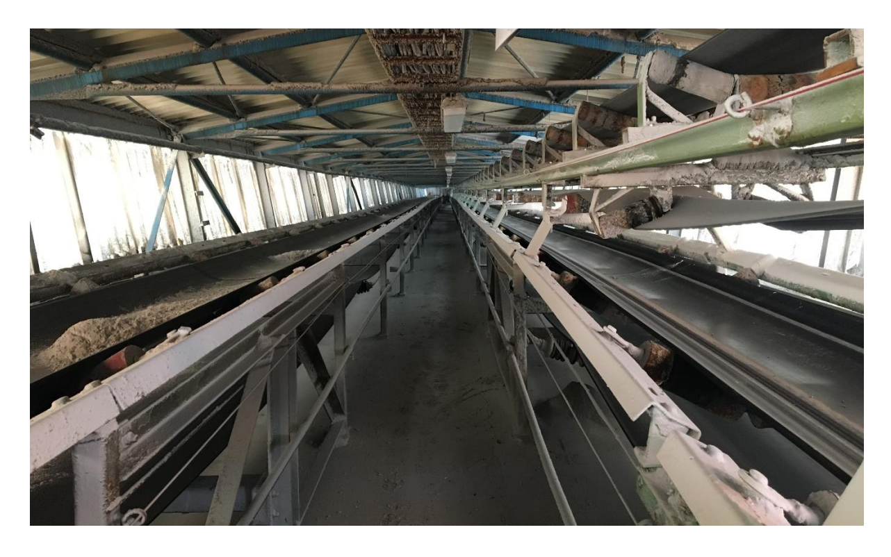
Onsite conveyor belts

The project was successful and K+S used AP Sensing's LHD solution for other K+S sites. AP Sensing's DTS technology is ideal for the extreme environmental conditions often found in mines. It is fully certified, resilient and maintenance-free, withstanding extreme temperatures without losing monitoring capabilities. Fiber optic LHD provides a simple and cost-effective solution for minimizing serious damage, protecting employees and reducing operational shutdowns.