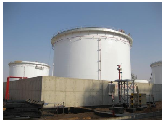
Foam extinguisher in foreground

The installation consists of 4 tanks in a cluster, with a 5 th tank a few hundred meters away. The DTS unit and the fire alarm system are housed in between. A single fiber sensor cable is used to monitor the 3 km length of the monitoring system for all of the tanks.