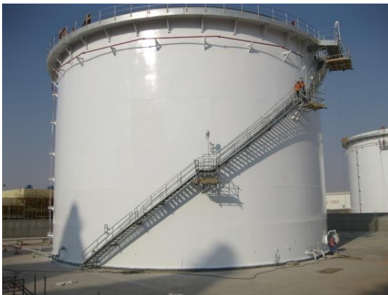
Floating-roof tanks in Riyadh

Working together with the local partner Tyco, AP Sensing was selected for their Linear Heat Series solution.