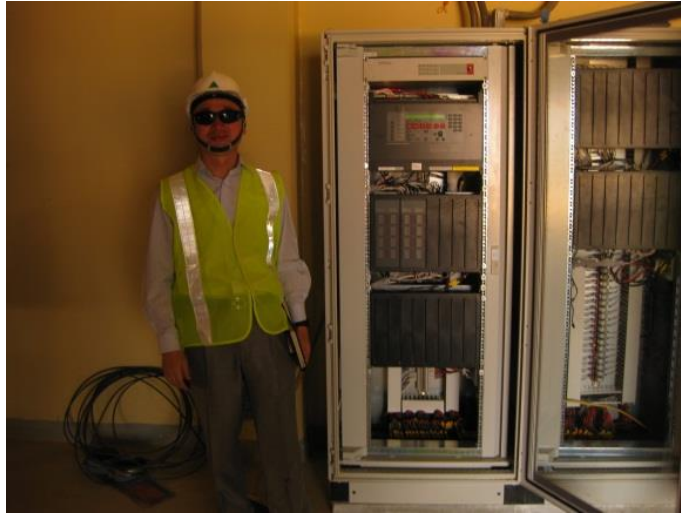
DTS (top) rack-mounted solution

A single DTS unit with 2 channels is used. Each tank is defined as a zone, with additional zones defined between the cluster, DTS housing, and the 5 th tank.