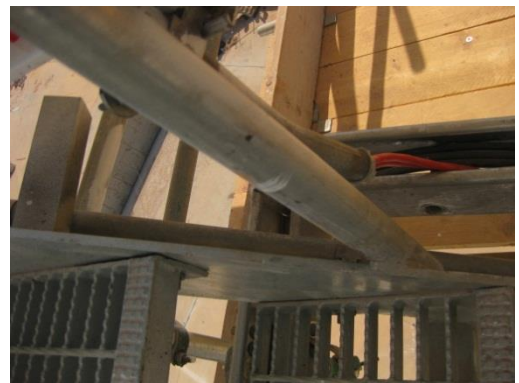
DTS fiber installation in and around the floating roof tanks