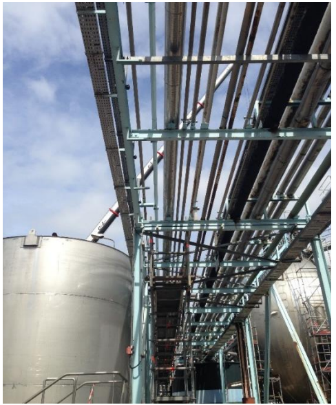
Left: Sensor cable wrapped around a flange for improved leakage detection Right: the "pipe rack" on the campus