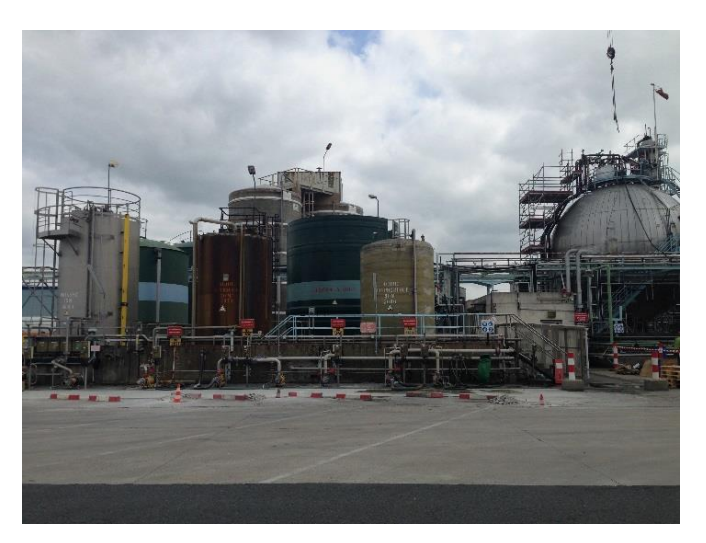
Left: Ammonia pipeline area Right: Production site in northern France; ammonia sphere on the right

A sensor cable with flexible metal inner and outer tubing was selected because of its optimal protection and strength, as well as its fast thermal response and appropriate operating temperature range. The fiber was retrofitted to the bottom of the insulated pipes and placed outside the insulation. Approximately 1,200 m of sensor cable was deployed altogether.