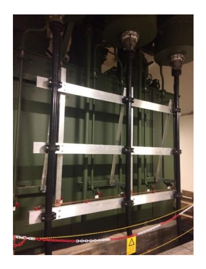
Installations at project site