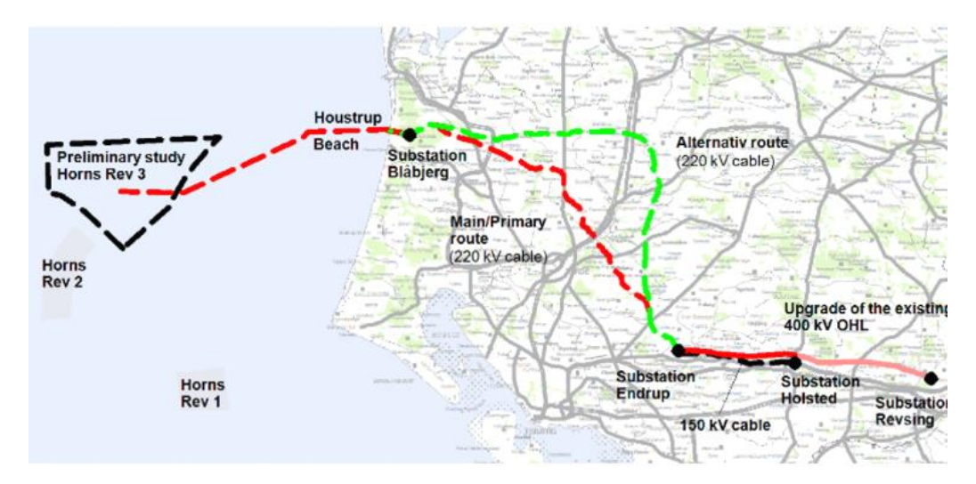
Off- and onshore power cable routing

Loose tube fiber optical cable with 4x 12 G.652D single mode fibers and 1x 6 OM3 multimode fibers were installed. At the subsea section, the sensor cable is located inside the three phase subsea cable, which is buried 1m below the seabed. At the land section, the sensor cable is located in a \emptyset 40 tube close to the center single phase cable, which is buried 1.4m below the surface.