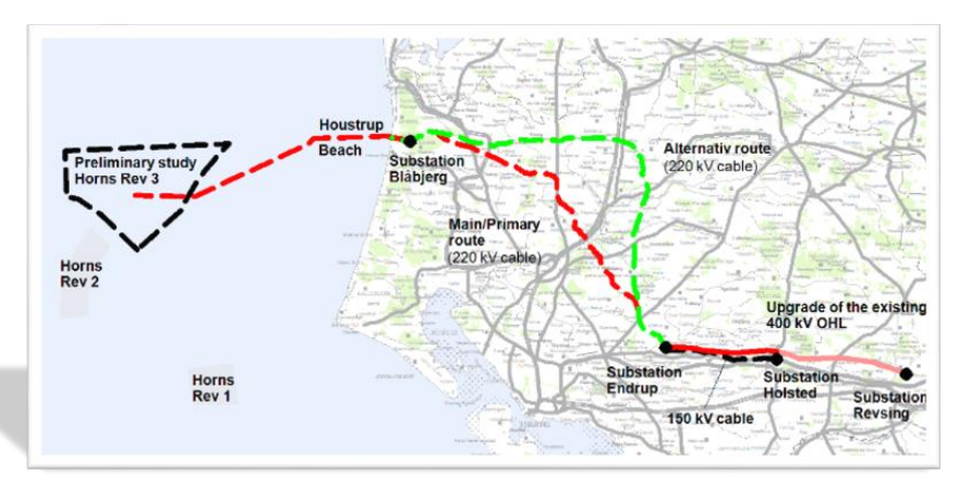
Off- and onshore power cable routing