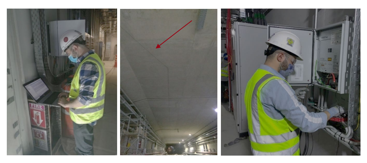
System Commissioning and Zone Configuration

Besides providing fire alarming capabilities, our fiber optic LHD system activates precisely the ventilation fans at the scene of fire to extract smoke from tunnels and draw it away from any station concourse. All alarms and ten-thousands of temperature values are received by the command center room via Modbus in order to monitor potential fires and their sizes, precise location, and direction of spread due to wind factors in the tunnel.