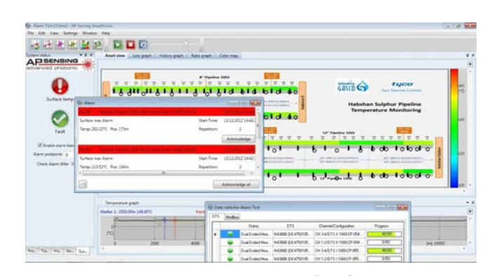
SmartVision Project Overview of Sulfur Pipeline

detection time and to improve leak location.