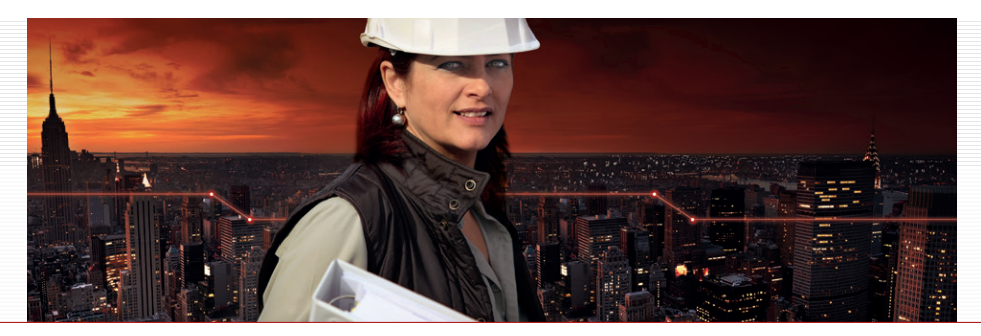
Leading the Way with Passion.

We develop our fiber optic sensing solutions based on the tradition of HP/Agilent Technologies , the world leader in optical test and measurement for over 35 years. Building on HP/Agilent's processes and knowledge, we have established ourselves as the leading solution provider for Distributed Fiber Optic Sensing (DFOS) in a wide range of applications.