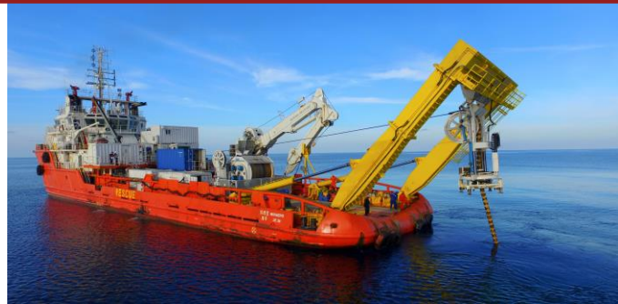
Subsea cable installation

In addition, intentional or accidental third party intrusion events are recorded, helping operators to develop awareness of hazards and identify the party responsible for the damage. Immediate and accurate cable fault location significantly improves repair times, therefore diminishing unscheduled cable downtimes.