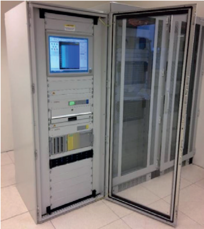
Figure 4: Fully integrated rack solution with DTS, DAS and SmartVision in the control room

The software tool collects the temperature data in real time from the two DTS devices and the alarms from the 3 DAS devices, providing the user with a combined overview of both systems.