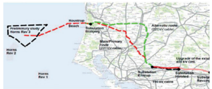
Figure 2: Off- and onshore power cable routing

APSensing’s proprietary asset visualization software, SmartVision, provides multiple operators at multiple locations with a graphic overview of all temperature and acoustic information for their critical infrastructures. The main user interface for SmartVision™ is located at the Endrup substation.