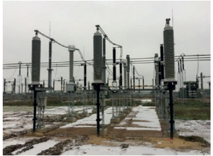
Figure 5: Installations at project site

AP Sensing's experienced Project Engineering team accompanied both pre energizing test phases of the land and subsea power cable sections. The entire system has performed as expected since the completion of the installation and plans were immediately underway for future projects. AP Sensing has sold many further DTS and DAS units to the customer and won a framework agreement for further projects. Both of these exemplify the level of customer satisfaction with AP Sensing's systems.