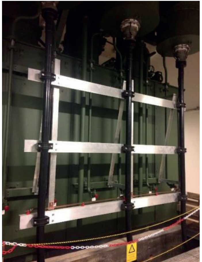
Figure 6: Installations at project site