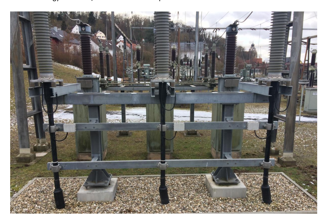
Power cable in Herrenberg substation

The acoustic monitoring system consists of a DAS system and an external data storage unit, integrated into a portable rack to allow for flexible transportation between the substations. DAS is used to monitor the cable for acoustic signals that would indicate a fault or a Third Party Intrusion (TPI) event that could be harmful for cable operation. The system is comprised of one single-channel N5000A DAS interrogator unit with a 40 km measurement range, DAS data acquisition unit and data storage unit. It is configured to monitor the power cable in real-time, visualize the acoustic energy over time/distance in waterfall plots and store the measured data.