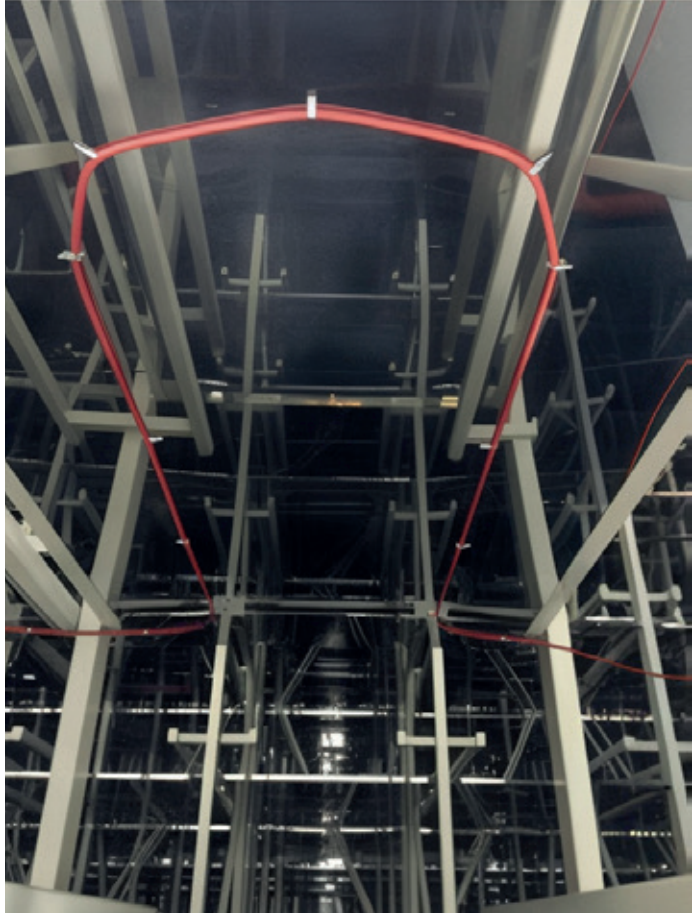
Optical fiber cable installation in the warehouse

The system passed the Final Acceptance Test (FAT) without any issues, and has been functioning properly since installation. A valuable infrastructure remains protected.