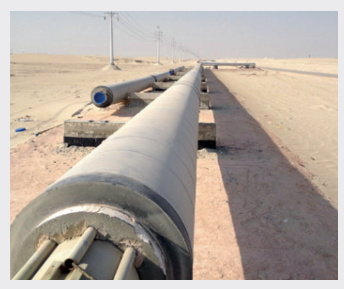
Sulfur pipeline utilizing AP Sensing monitoring solution